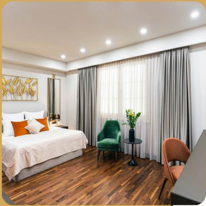
Interior Room Without Window