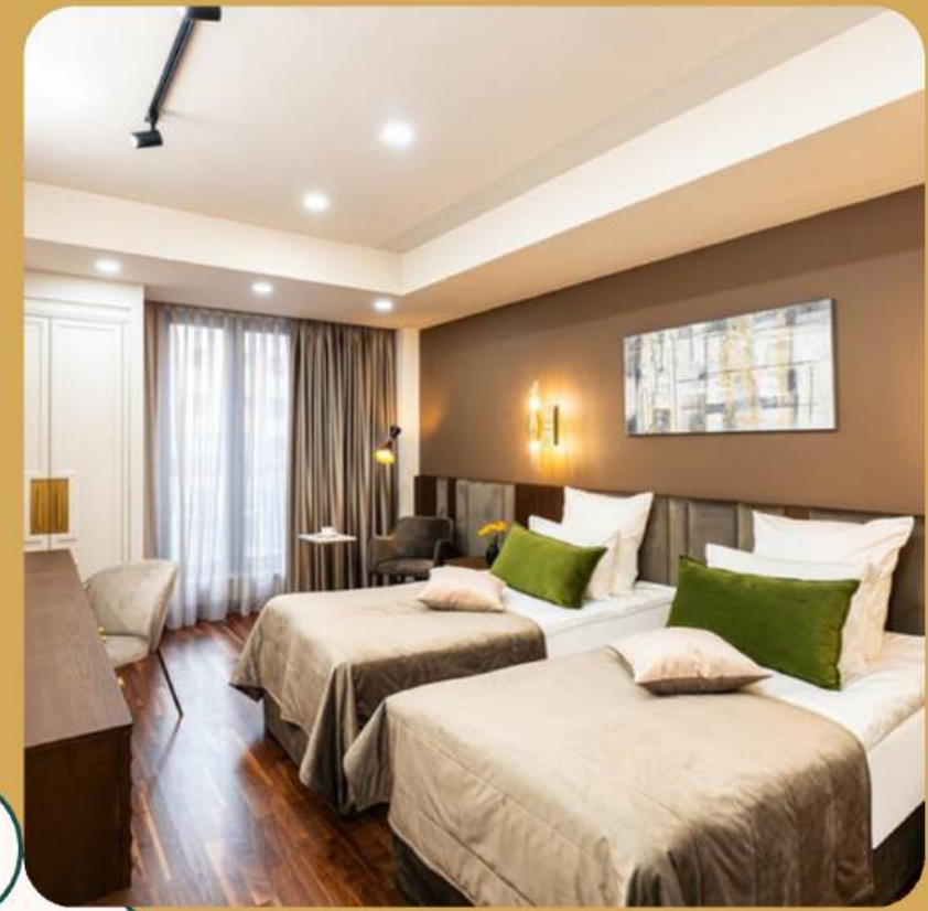
Deluxe Twin Room