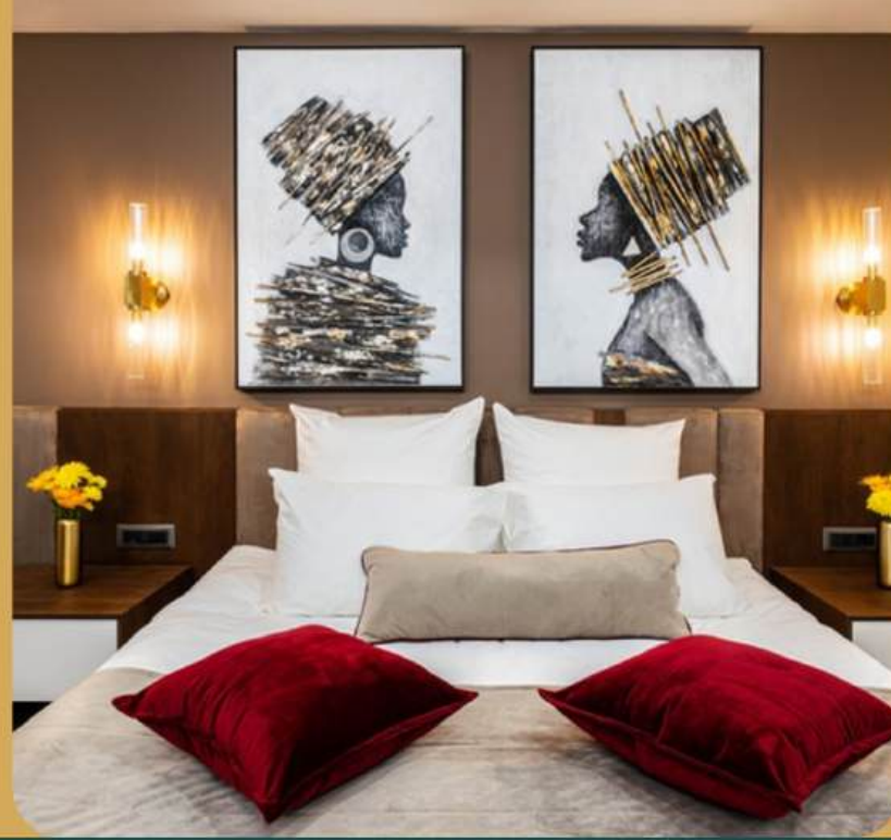
Deluxe Double Room